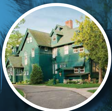
Linden Hill Historic Estate

Visit the Linden Hill Historic Estate offering seasonal museum tours of the Weyerhaeuser home from Memorial Day-Labor Day. Visit our website for the official tour schedule and for more information about the estate history, upcoming events, lodging and rental opportunities, ways to get involved, and more.