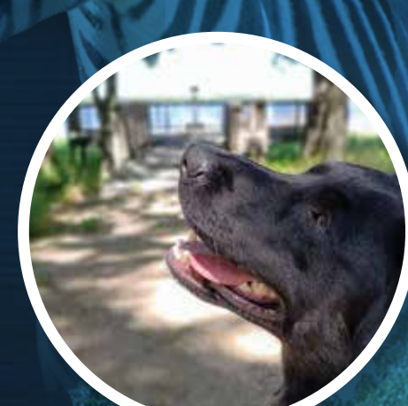
Crane Meadows Wildlife Refuge

Crane Meadows National Wildlife Refuge was established in 1992 to protect and restore wetlands and enhance waterfowl and other migratory bird habitat. Visitors are invited to experience the Refuge. Sandhill cranes and a host of other wildlife may be seen or heard as they use the sedge meadows, shallow lakes, wetlands, grasslands, oak woods, and other habitats on the Refuge.