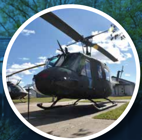
Minnesota Military Museum

Nowhere in Minnesota are the experiences of military men and women so vividly captured and interpreted for the public as at the Minnesota Military & Veterans Museum. Indoor and outdoor exhibits depict the stories and contributions of Minnesotans who served in all branches of service in time of peace and war, from Minnesota's early years, through the World Wars, leading up to current conflicts. This is the only military museum in the state representing all branches of the military.