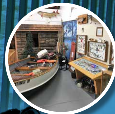
MN Fishing Museum & Hall of Fame

The MN Fishing Museum and Hall of Fame is dedicated to preserving the heritage and history of freshwater fishing. See displays of Minnesota's State Record fish, fishing boats, outboard motors, rods and reels and thousands of fishing artifacts. Don't forget to check out the O-Fish-L Gift Shop!