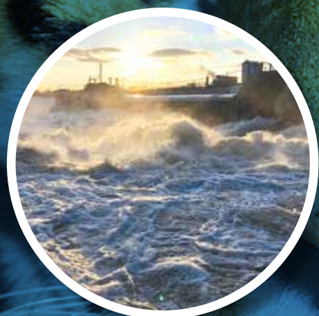
Little Falls Dam

The dam was built in 1849, it was the second largest source of water power in Minnesota. Water power stimulated industrial development in the late 1800s. The power of the Mississippi provided electricity for the lumber mills, flour mills, boat works and paper mills. You can view the dam from James Green Park and take a stroll through the neighboring park, Maple Island, that has walkways along the Mississippi River.