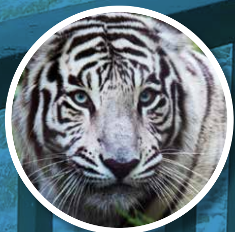
Pine Grove Zoo

Pine Grove Zoo has been welcoming guests since 1913 and is proud to host visitors throughout Minnesota as well as the United States. The zoo is dedicated to promoting educational, environmental and conservation messages while creating lifelong memories for families and visitors. We realize the importance of family and community and strive to make positive, meaningful and life-changing memories, while creatively inserting our enthusiasm for nature.