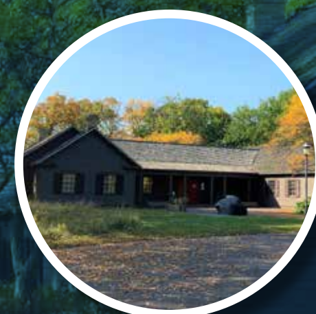
Charles A. Weyerhaeuser Memorial Museum

The Morrison County Historical Society is dedicated to the preservation and sharing of Morrison County's history. It owns and operates The Charles A. Weyerhaeuser Memorial Museum in Little Falls, Minnesota. For museum hours and more local history, be sure to check out our website,