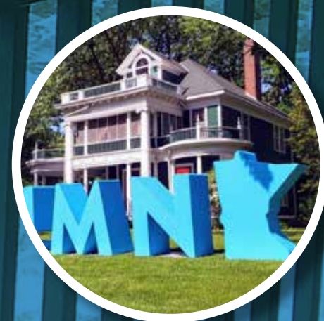
Visit Little Falls

The Little Falls Convention and Visitors Bureau currently uses the historic house as a visitor's information center and office. The home is on the National Register of Historic Places and is open to the public for free, self-guided tours daily and year round. There you can find visitor information on Little Falls and surrounding areas including area maps, biking routes, public arts guides, historic walking/driving guides, Lindbergh driving tour and brochures on all the areas attractions.