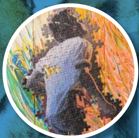
Great River Arts

The dam was built in 1849, it was the second largest source of water power in Minnesota. Water power stimulated industrial development in the late 1800s. The power of the Mississippi provided electricity for the lumber mills, flour mills, boat works and paper mills. You can view the dam from James Green Park and take a stroll through the neighboring park, Maple Island, that has walkways along the Mississippi River.