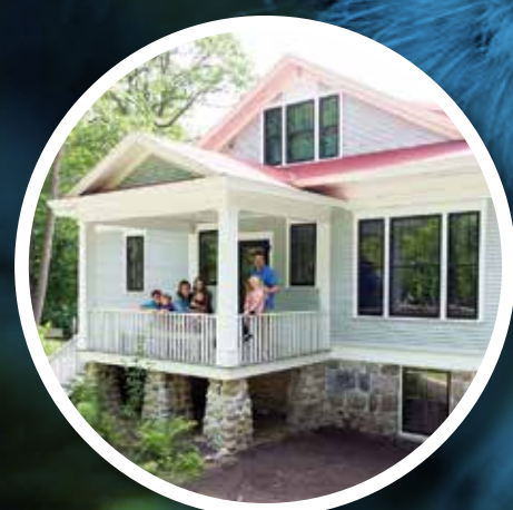
Charles Lindbergh House, Museum & State Park

Explore Lindbergh's original furnished childhood home to learn how his childhood experiences shaped the legacy he would create. Learn about his contributions to aviation, medical science, environmentalism, and complex viewpoints through the museum's interactive exhibits. Discover the beauty of the Mississippi River by walking the hiking trails connecting into Charles A. Lindbergh State Park. See for yourself where a dream took flight!